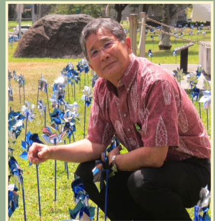
Prevent Child Abuse Hawaii placed pinwheels along the entrance to the State Capitol in recognition of National Child Abuse Prevention Awareness Month in April