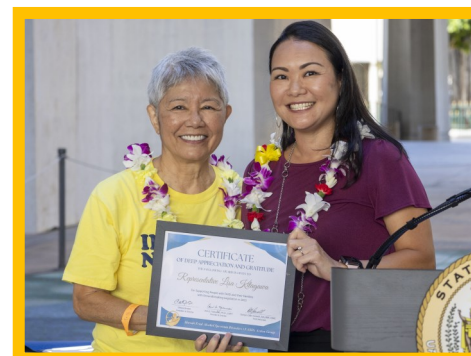
Recognition for FASD Support