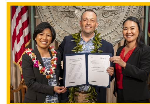
Bill Signing with Gov. Green