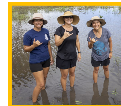
Visit to Kakoʻo ʻŌiwi