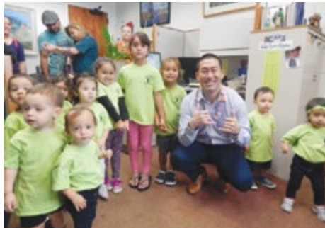
Early Pre-school visitors to the State Capitol lobbying for critical school programs.