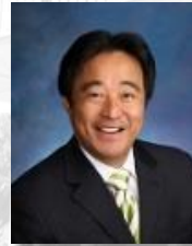
Senator Glenn Wakai