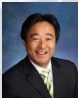
Senator Glenn Wakai