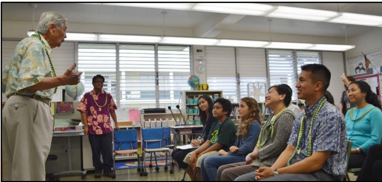
Governor George Ariyoshi speaks about the importance of challenging future generations to consider how individuals and the State as a whole can make meaningful contributions for Hawaii.

This year the contest was sponsored by the Hawaii State House of Representatives, Hawaii Future Caucus, and the aio Foundation.