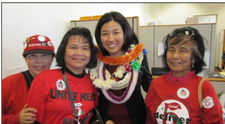
Members of local union, UNITE HERE, Local 5, with Rep. Ichiyama.