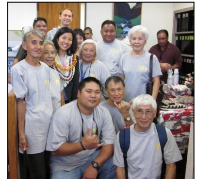
Members of ILWU Local 142 with Rep. Ichiyama.