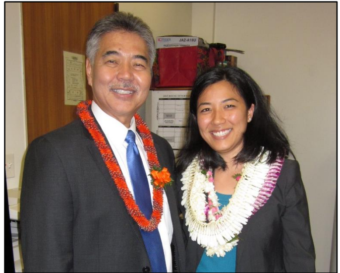
Rep. Ichiyama and Governor Ige look forward to working with you this legislative session.