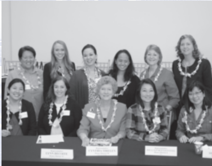
As a member of the Women's Legislative Caucus, Rep. Ichiyama worked to pass measures to ensure women receive accurate and timely information regarding their health care.

Authorizes the counties, through their employees or authorized agents, to enter private property to control or eradicate invasive species and pests if an owner refuses to allow access and after written notice from the county.