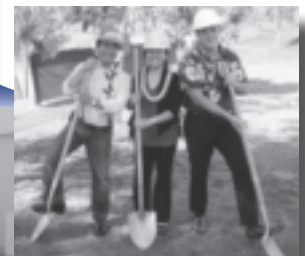
Rep. Ichiyama, Rep. Johanson, and Sen. Wakai at the groundbreaking ceremony for Phase 2A of the Moanalua Performing Arts Center, which includes a chorus room and dance studio.

PHASE 2A - Choral/Dance Room $7,600,000 In construction, estimated completion June 2018