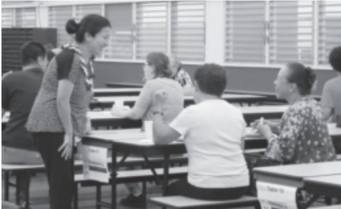
Rep. Ichiyama greeted residents at the Salt Lake Town Hall in March 2017.