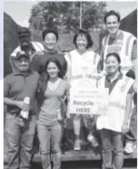
Legislators help turn trash into cash for student programs at the Moanalua Middle and Elementary School Aloha Aina Day.