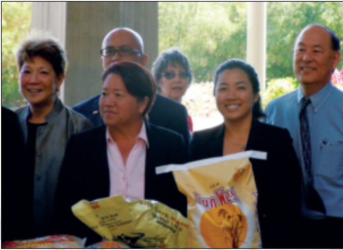
Rep. Ichiyama and fellow legislators show their support for seniors at the Kupuna Rally at the State Capitol.