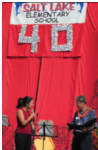
Congratulations to Salt Lake Elementary School on their 40 th Anniversary!

In order to protect Kamananui Valley, the last remaining undeveloped ahupua'a in urban Honolulu, HCR172 requests the Department of Land and Natural Resources to work with the Moanalua Gardens Foundation to develop a Memorandum of Understanding and to provide a progress report to the Legislature prior to its next session in 2012