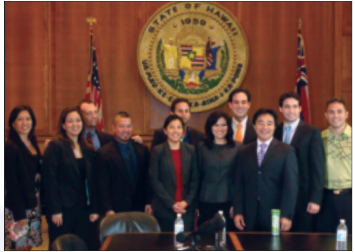
Rep. Ichiyama participates in a forum featuring young elected officials hosted by KITV.

foreclosure laws protecting owner-occupants in the country. The new law establishes a 3-year Mortgage Foreclosure Dispute Resolution Program for non-judicial foreclosures beginning no later than October 1, 2011. The law voids any mortgage foreclosure actions taken by an unlicensed nonexempt mortgage servicer and prohibits egregious misconduct by foreclosing mortgagees.