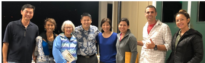
Waikapu Community Association Meeting