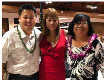
Kaisahan Christmas Party