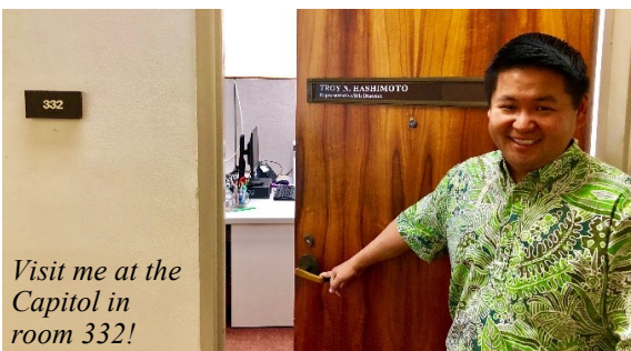
Visit me at the Capitol in room 332!