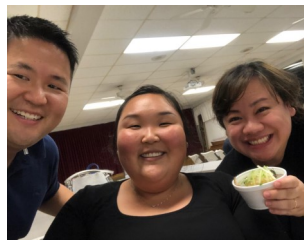
Japanese Cultural Society mochi making