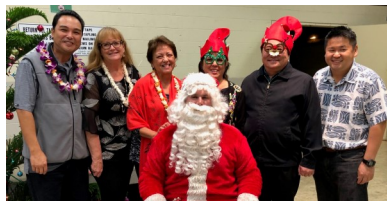
Maui Farm Bureau Christmas Party