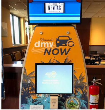
The Maui Lani Safeway kiosk.

For more information, contact the Maui County Division of Motor Vehicle call center at (808) 270-7363.