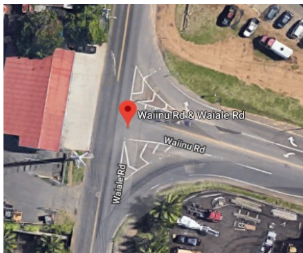
Waiale-Waiinu road intersection on Google Maps Satellite Imagery

The Waiale-Waiinu road intersection is a bottleneck for traffic coming from Maui Lani Parkway and Mahalani Street near Maui Memorial Medical Center, and traffic coming from Wailuku town to the north and from Maui Lani to the south, where new businesses and homes continue to be built. The county Public Works Department is completing a study on possible solutions before the summer.