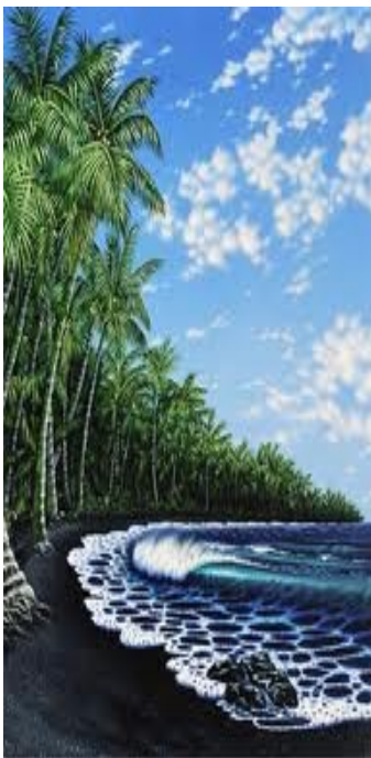
Kaimu Black Sand Beach