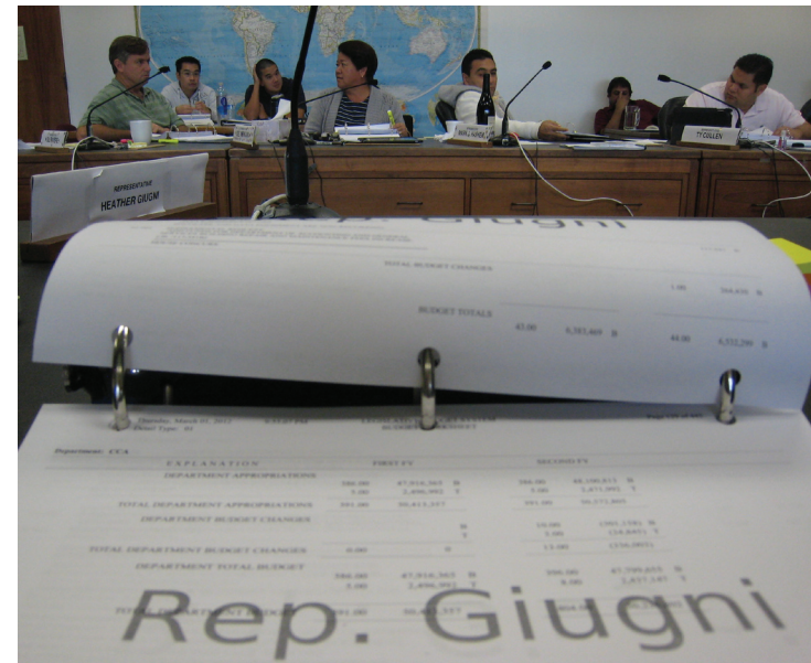
Finance Committee Meeting