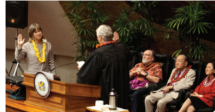
Swearing in Ceremony, February 21, 2012