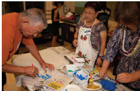
Making T-Shirts in celebration of The Oahu Hongwanji Council Sangha Day at Halawa Community Center March 4, 2012