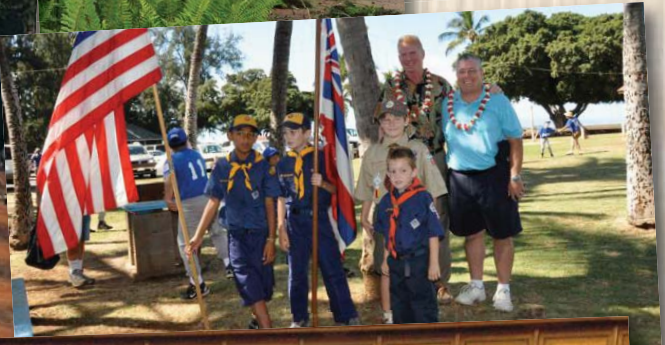
Cub Scouts color guard at Kihei Little League Opening Day.