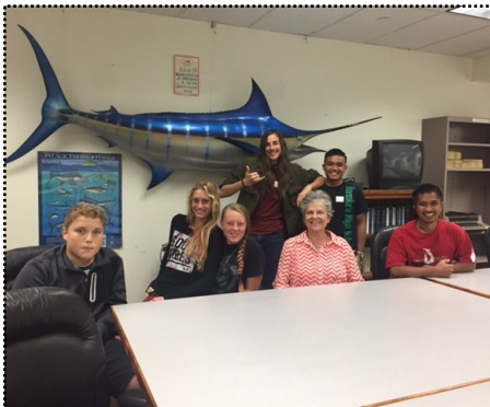
Rep Evans with Honoka'a High School students from Future Farmers of America.

HB 2517 HD2: Adds county-certified cesspools within 200 feet of an existing sewer system to the definition of "qualified cesspool" for the purposes of determining eligibility for an upgrade, conversion, or connection income tax credit.