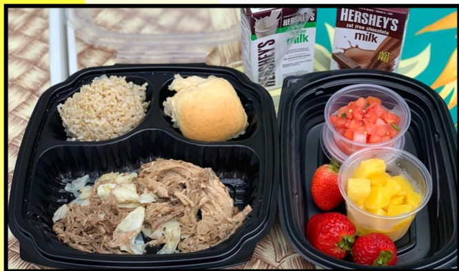
Meal Provided by 'Aipono Truck for Keiki on the Wai'anae Coast.