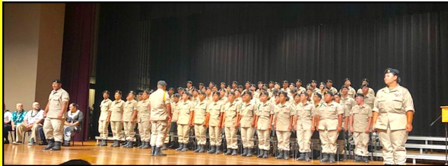
2019 Youth Challenge Academy Graduation Class 18-2 (50) at Pearl City Culture and Arts Auditorium.