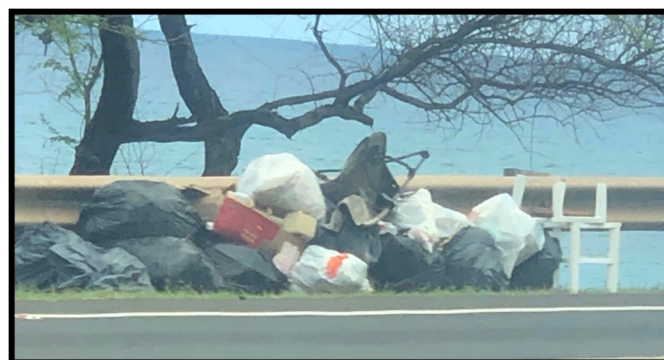
Illegally dumped trash along Farrington Highway that was removed by the Department of Transportation..