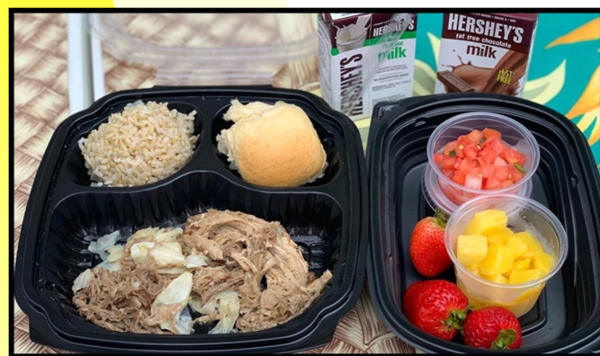
Meal Provided by 'Aipono Truck for Keiki on the Wai'anae Coast.