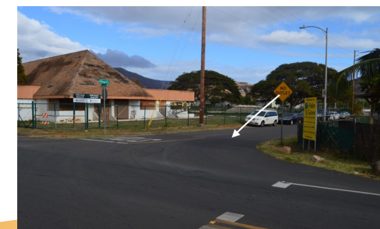
3/26/19 The crosswalk will be installed at the St. Johns and Kulaaupuni intersection on Kulaaupuni.

Sometime between the end of April and the beginning of May the City and County Department of Transportation Services will be surveying the area of Ma’ili Elementary, specifically the intersection of St. Johns and Kulaaupuni, to determine if a crosswalk installment is necessary. The surveying will take place during the peak hours of pedestrian traffic. There needs to be a record of more than 20 pedestrians (adults count as 1 and children count as 2) recorded in the area within a certain time frame for a crosswalk installment to be submitted for processing.