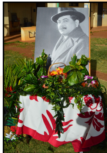
3/8/2019: Nānākuli Elementary School's Prince Jonah Kūhiō Kalaniana'ole Festival is in celebration and honor of Prince Jonah Kūhiō and his efforts to improve the lives of the native people of Hawaii.