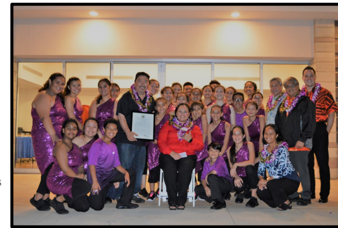
3/6/2019: The students of Nānākuli Performing Arts Center and the Legislators following the performance given by the students.