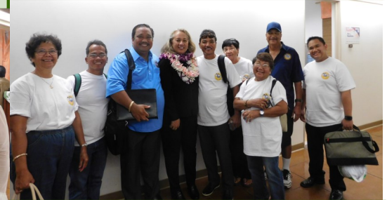
The ILWU Ohana from Maui. They come every Opening Day to bring their Aloha to all of the legislators.