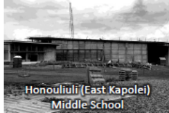
Honouliuli (East Kapolei) Middle School