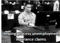
Helping process unemployment insurance claims