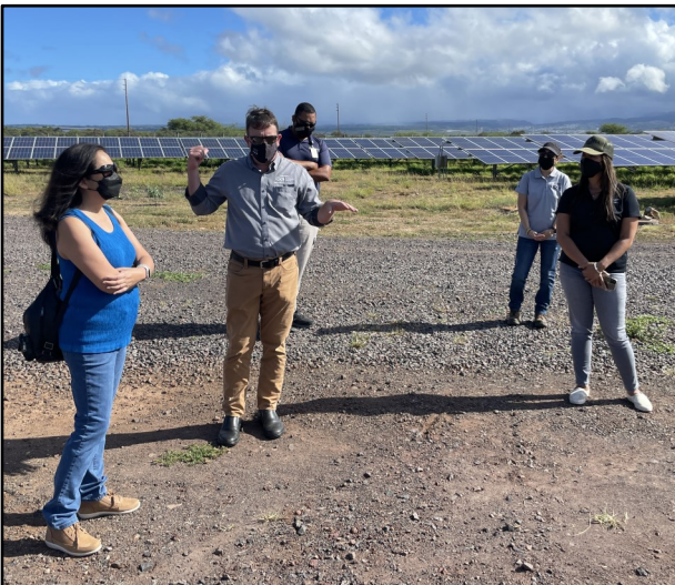
Site visit of the West Loch Solar Farm in Ewa Beach with Hawaiian Electric.