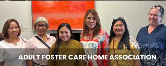
ADULT FOSTER CARE HOME ASSOCIATION