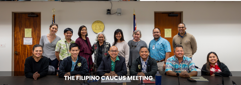
THE FILIPINO CAUCUS MEETING