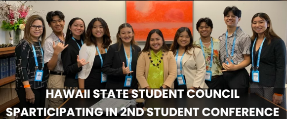
HAWAII STATE STUDENT COUNCIL PARTICIPATING IN 2ND STUDENT CONFERENCE