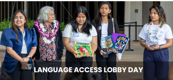
LANGUAGE ACCESS LOBBY DAY