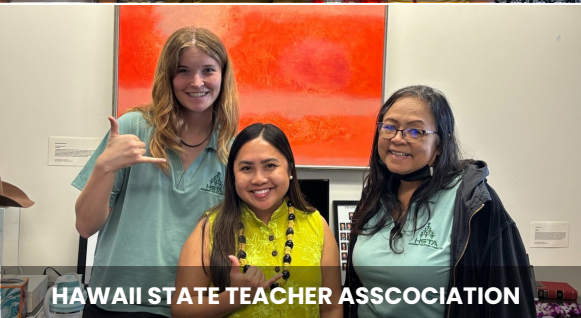
HAWAII STATE TEACHER ASSOCIATION