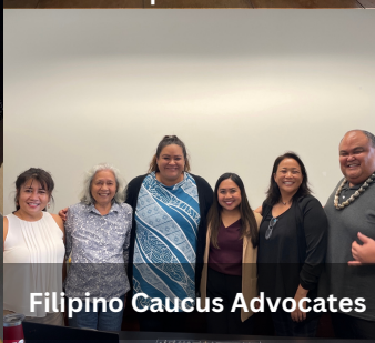
Filipino Caucus Advocates