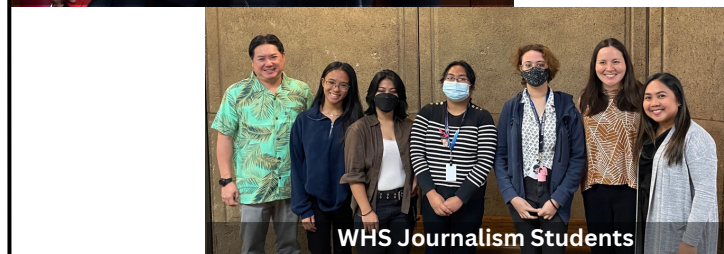
WHS Journalism Students