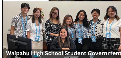
Waipahu High School Student Government