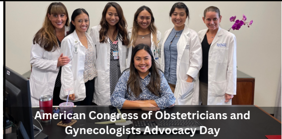
American Congress of Obstetricians and Gynecologists Advocacy Day

To learn more about the latest versions of the bills, testimony submitted and more, go to capitol.hawaii.gov