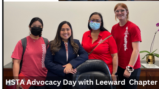
HSTA Advocacy Day with Leeward Chapter