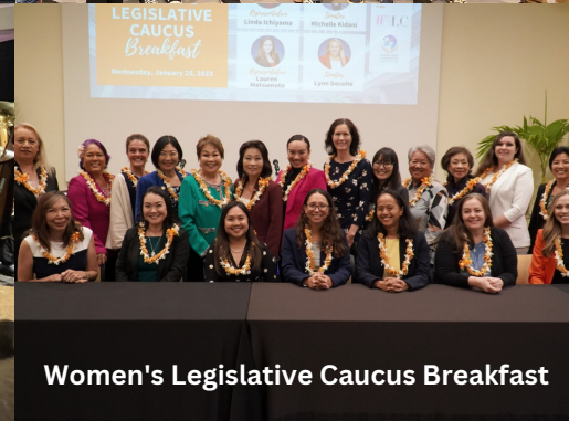
Women's Legislative Caucus Breakfast