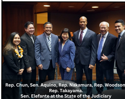
Rep. Chun, Sen. Aquino, Rep. Nakamura, Rep. Woodson, Rep. Takayama, Sen. Elefante at the State of the Judiciary

As the session continues, stay connected with me at replamosao@capitol.hawaii.gov or at (808) 586-6520.