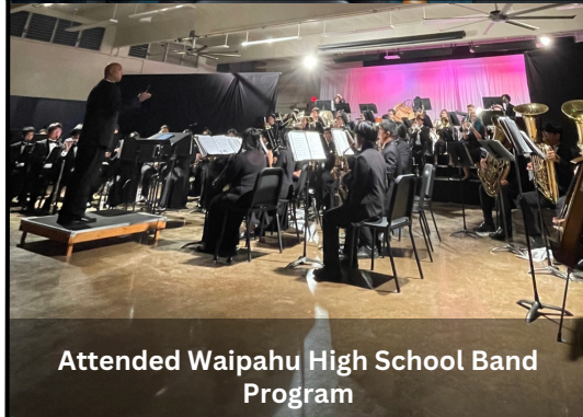
Attended Waipahu High School Band Program