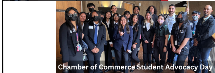
Chamber of Commerce Student Advocacy Day