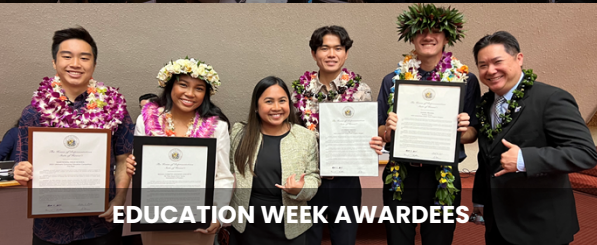
EDUCATION WEEK AWARDEES