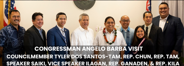
CONGRESSMAN ANGELO BARBA VISIT