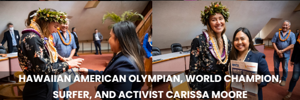
HAWAIIAN AMERICAN OLYMPIAN, WORLD CHAMPION, SURFER, AND ACTIVIST CARISSA MOORE