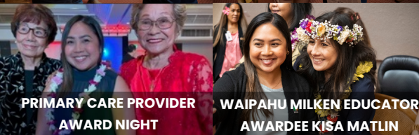
PRIMARY CARE PROVIDER AWARD NIGHT