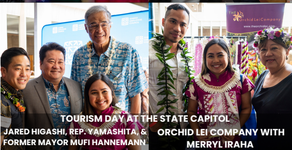
TOURISM DAY AT THE STATE CAPITOL