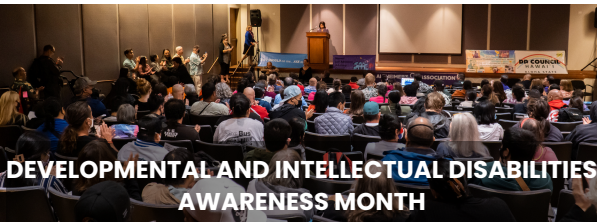
DEVELOPMENTAL AND INTELLECTUAL DISABILITIES AWARENESS MONTH