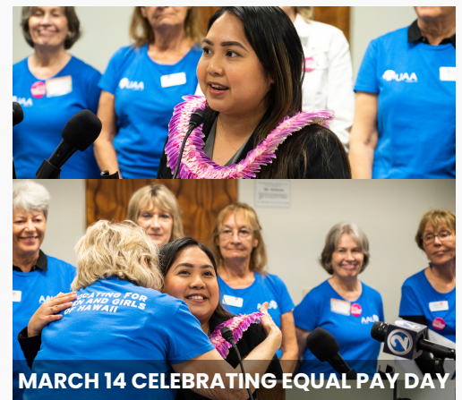
MARCH 14 CELEBRATING EQUAL PAY DAY

Requires job listings to include an hourly rate or salary range. Prohibits an employer from discriminating between employees because of any protected category established under state law, by paying wages to employees in an establishment at a rate less than the rate at which the employer pays wages to other employees in the establishment for substantially similar work on jobs the performance of which requires equal skill, effort, and responsibility, and that are performed under similar working conditions.