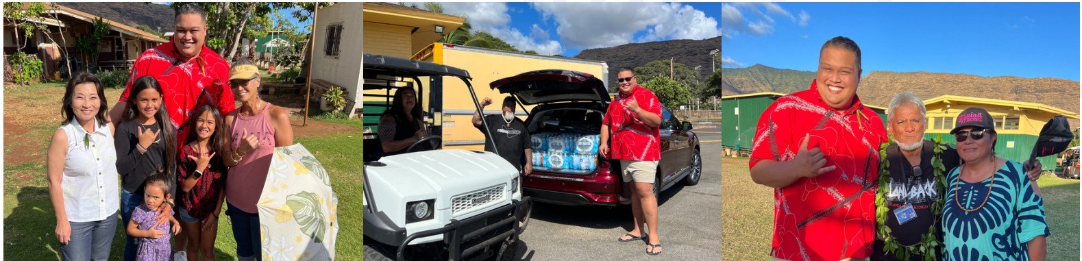
Kāko'o Lāhainā Benefit Concert was a success! Mahalo event organizers for hosting this event and Mahalo Ka Waihona O Ka Na'auao for hosting this event!