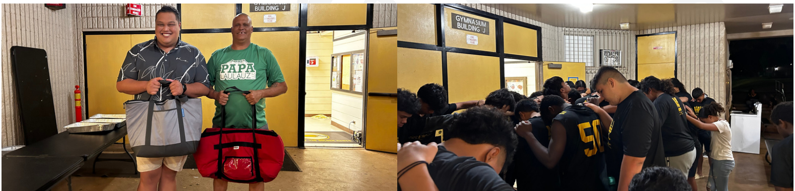
Keep up the great work, Golden Hawks football!