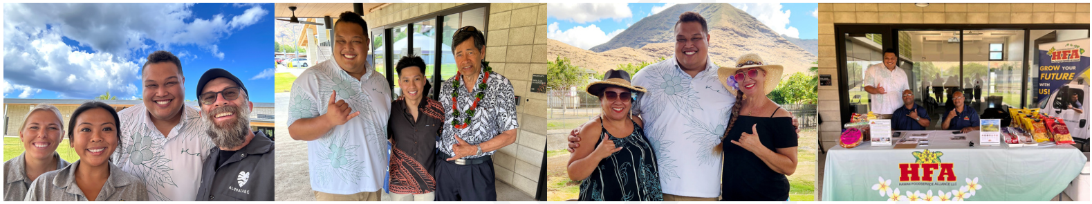
Mahalo Department of Hawaiian Homelands for partnering with my office to host a successful resource fair! We plan to make this an annual event.