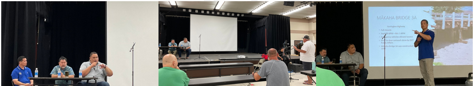
Mahalo Hawai'i DOT and C&C of Honolulu DTS for joining us, on September 5th, for our town hall, it was a great and informative town hall! I appreciate you all and thank you for being amazing partners for our community!