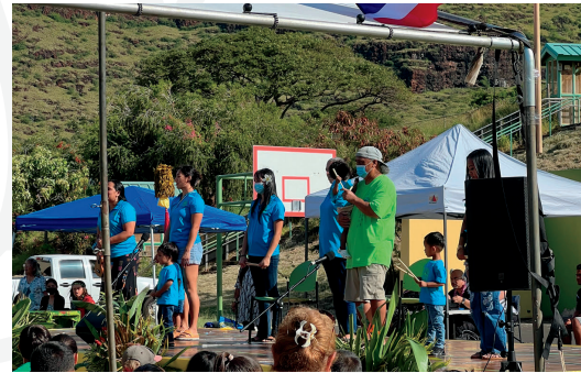
Nanakuli Elementary School's Kuhio Day Celebration.