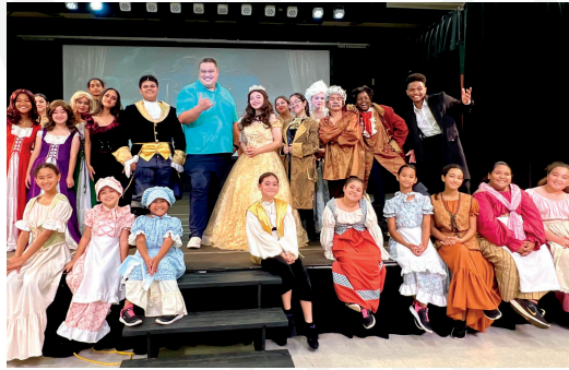
Nanakuli Performing Arts students with Rep. Kila at the school's production of Beauty and the Beast.