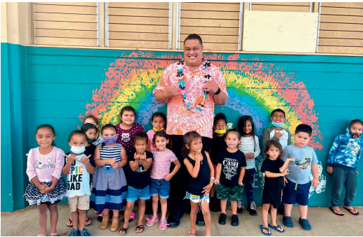
Representative Kila reading books to the children at the Headstart program located at Wai'anae Elementary School.