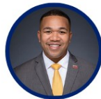
REPRESENTATIVE CEDRIC ASUEGA GATES