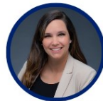
REPRESENTATIVE NATALIA HUSSEY- BURDICK