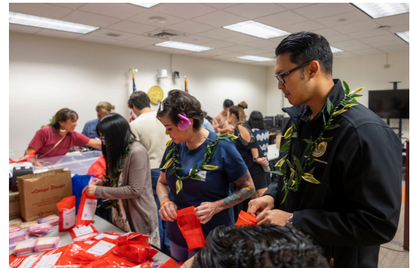
MA'I MOVEMENT 2024