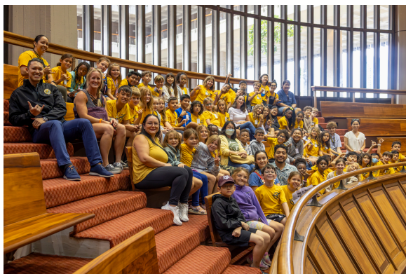
FORT SHAFTER ELEMENTARY VISITS THE CAPITOL!