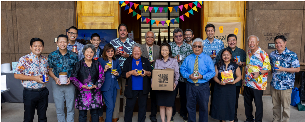
FOOD DRIVE 2024!