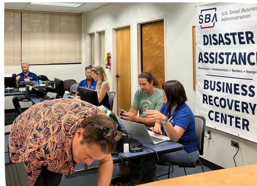
MRTC, SBA BUSINESS RECOVERY CENTER

This year MRTC similarly started seeing a recovery of events and workshops such as Maui Tech Ohana and general networking to bring community together. In August of 2023, MRTC began support for Maui disaster recovery efforts by providing SBA with a home office to centralize operations, and FEMA for additional space needs.