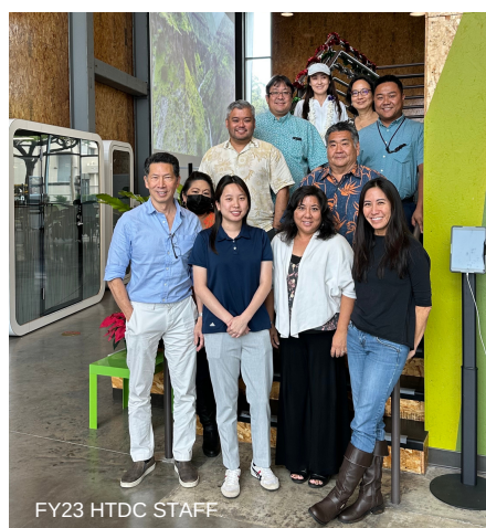
FY23 HTDC STAFF

Dear Stakeholders, Collaborators, and Supporters,