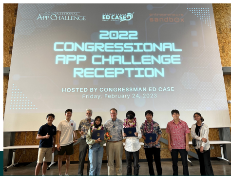
CONGRESSMAN ED CASE APP CHALLENGE FEB 2023

Starting early in 2023, the Sandbox began experiencing an over abundance of requests to help host in-person events to re-connect community through showcases of innovation, workshops, coworking and various networking opportunities. This year the Sandbox was also fortunate to have hosted many special VIP guests including Congressman Case, Hirono, and SBA Administrator Isabel Guzman.