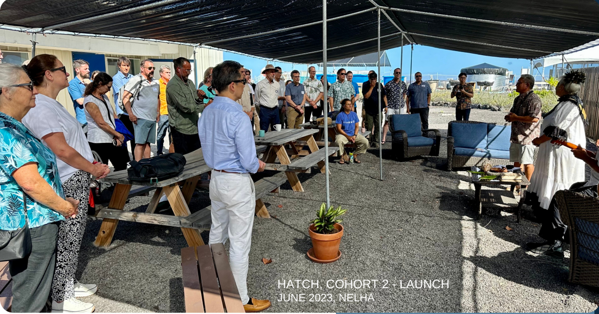
HATCH COHORT 2 - LAUNCH JUNE 2023, NELHA