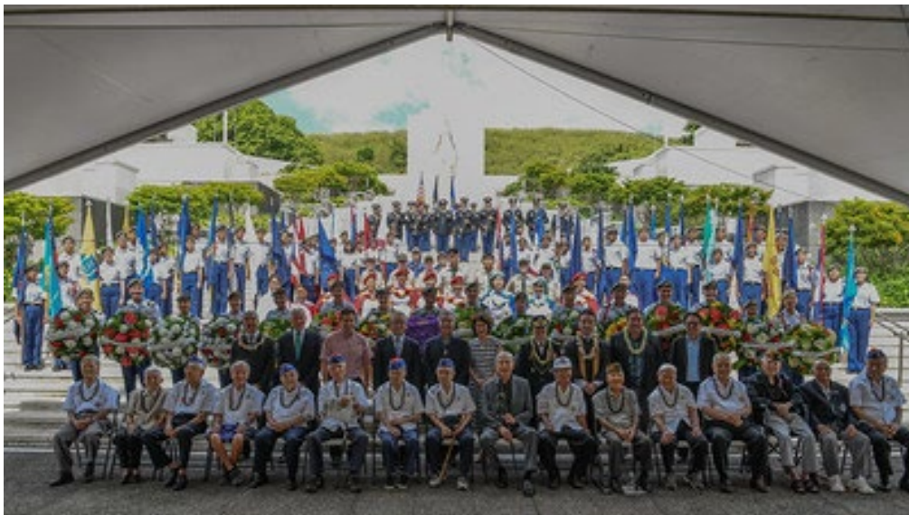
Nisei Soldier Memorial Service participants September 2019.