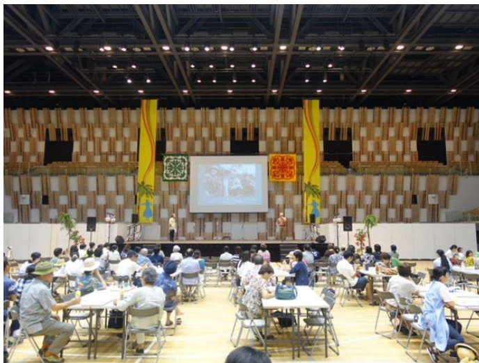
Presentation at Nagaoka City, Japan Auditorium, July 2018.

According to the Japanese Consulate of Honolulu, pre-COVID over 10,000 Japanese middle, high school and university students visited Hawaii each year for educational and cultural exchanges. The NVL has made numerous presentations to some of these student groups including tours of facilities like the 100 th Infantry Battalion clubhouse.