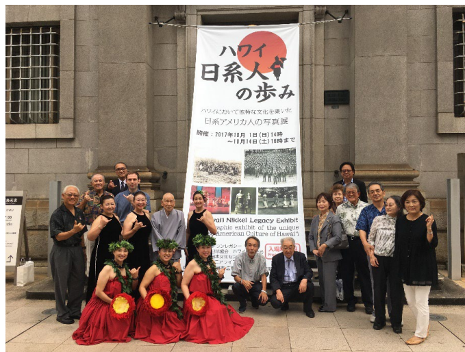
HNLE Opening Ceremony Participants, Hiroshima, November 2017.

We estimated that over 50,000 visitors saw the exhibit at these locations. In addition, several presentations were made to interested audiences on the history and culture of Hawaii AJA.