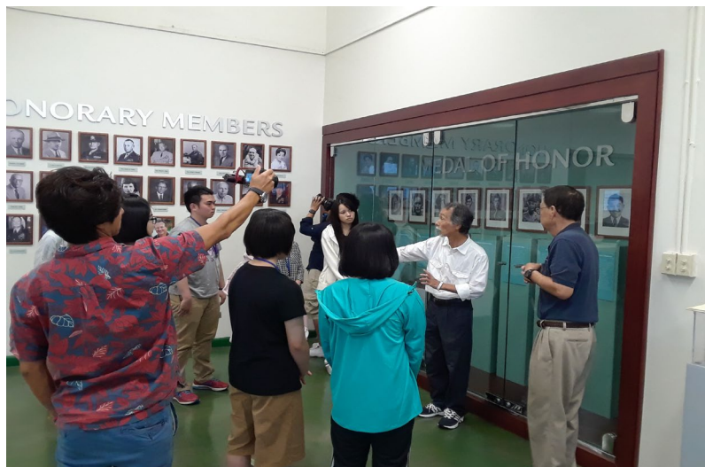
Presentation and tour to Japanese students from Fukushima, Japan, March 2018 at the 100 th Infantry Battalion Clubhouse.

According to the Japanese Consulate of Honolulu, pre-COVID over 10,000 Japanese middle, high school and university students visited Hawaii each year for educational and cultural exchanges. The NVL has made numerous presentations to some of these student groups including tours of facilities like the 100 th Infantry Battalion clubhouse.