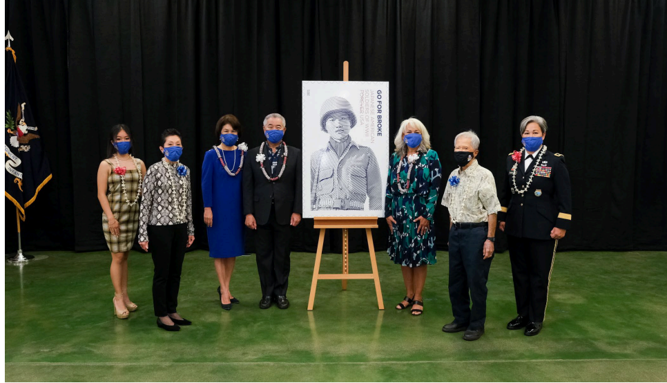
Go For Broke Stamp Unveiling Ceremony, June 2021.

In 2023, the NVN again reached out the NVL for support in coordinating a site visit in December with the National Museum of the United States Army (NMUSA) for preliminary discussions about bringing an exhibit on the Nisei soldiers to Oahu.