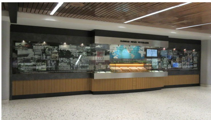
NVL Nisei Soldier Exhibit at DKI Airport.

We expanded our outreach through a significant investment in a permanent airport exhibit located inside Terminal 1 of the Daniel K. Inouye International Airport. The expansive historical exhibit documents the wartime and post war contributions of the Nisei veterans through text, photographs, and artifacts.