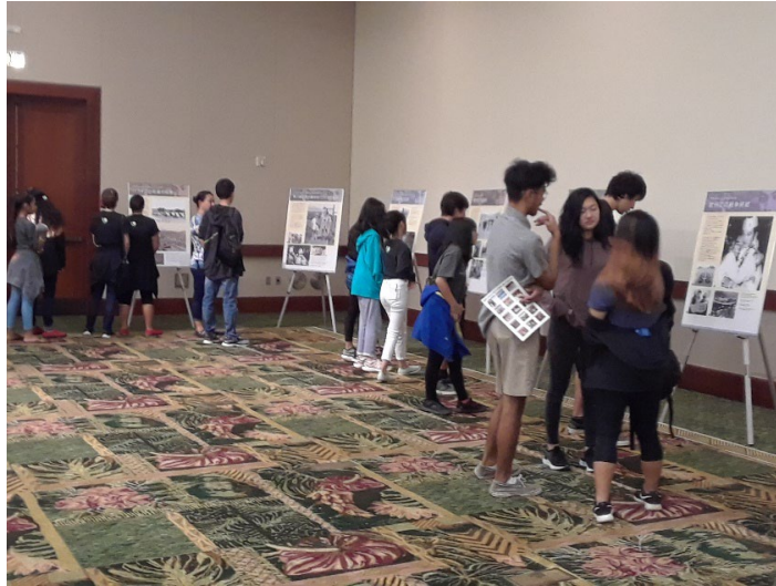
Hawaii High School Students at Honolulu Festival, March 2018.

In 2018, the HNLE toured the State of Hawaii as part of the 150 th anniversary celebration of the initial Japanese immigration to Hawaii, known as the Gannenmono. The tour was a partnership between the NVL and the Japanese Consulate of Honolulu.