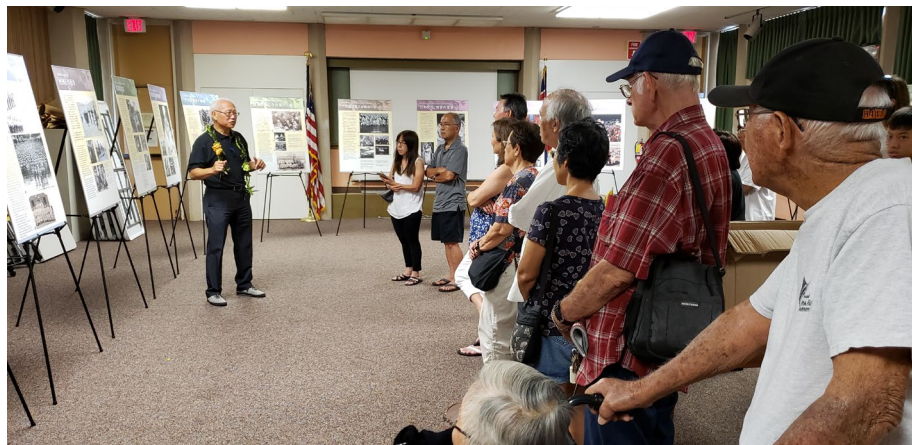
Guided tour at Pearl City Public Library, August 2019.

In 2019, the HNLE was displayed at numerous locations on Oahu. These exhibits were suspended from 2020 to 2022 due to COVID restrictions and are expected to resume as public restrictions have been removed.