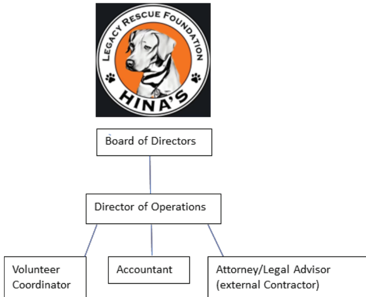
2023 Organizational Chart

The applicant shall illustrate the position of each staff and line of responsibility/supervision. If the request is part of a large, multi-purpose organization, include an organization chart that illustrates the placement of this request.