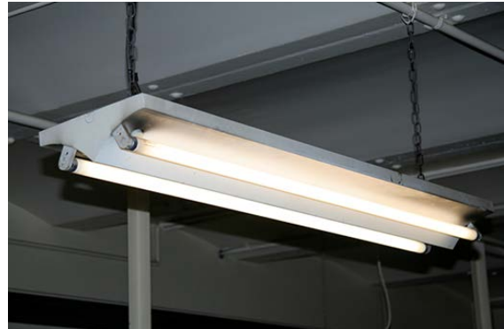
Figure 1. General-purpose, white light fluorescent light bulbs.

LEDs have advanced tremendously over the last 10 years. Our lighting market research found that today LEDs are widely available and cost effective as replacements for general-purpose, white light fluorescent light bulbs across the different sizes and shapes. General-purpose, white light bulbs are most commonly found in office building settings or in certain residential situations like a kitchen or basement (see Figure 1). LEDs were found to produce the same or better light quality, last 2-3 times longer, have positive economic outcomes for consumers, and not contain mercury compared to their general-purpose fluorescent counterpart. SB 690 only proposes to transition out these types of fluorescents and would not cover specialty fluorescents, such as ultraviolet (UV) fluorescents used for tanning booths or other specialty purposes.