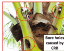
Bore holes caused by CRB

Suspect CRB damage, beetles, and larvae should be reported to the CRB Response at 643-PEST (7378) or email: BeetleBustersHI@gmail.com