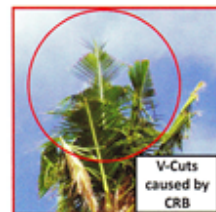
V-Cuts caused by CRB

For the latest information about CRB, visit: http://hdoa.hawaii.gov/pi/main/crb/