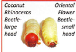
Coconut Rhinoceros Beetle-large head