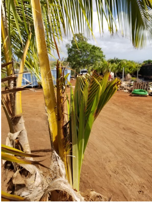
Images of CRB Infestation at a Kunia Farm