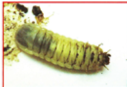
Oriental Flower Beetle grubs straighten out and crawl on their backs.