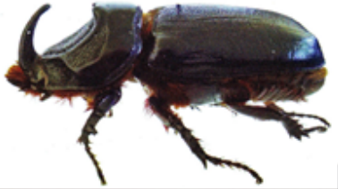
CRB are about 2-2.5 inches long

Detected in 2013, Coconut Rhinoceros Beetle (CRB) is the largest beetle on O'ahu. Native to Southeast Asia, CRB has invaded the Western Pacific Region. Early detection and containment are essential to prevent the spread of CRB throughout Hawai'i.