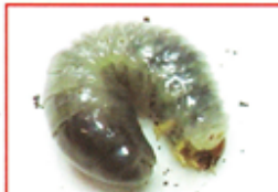
CRB grubs crawl on their sides in a C-shape.