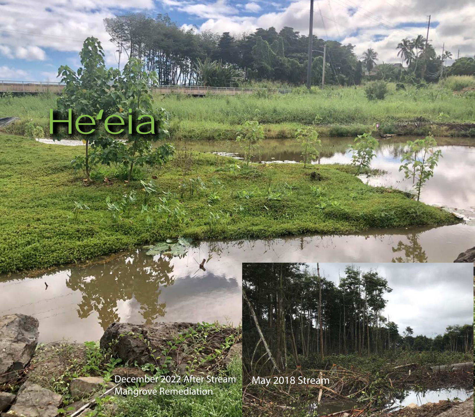
December 2022 After Stream Mangrove Remediation