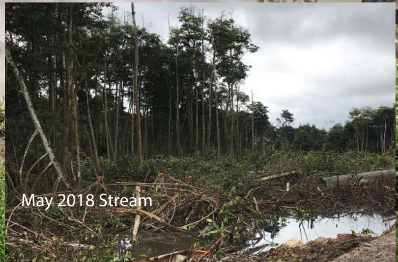
May 2018 Stream