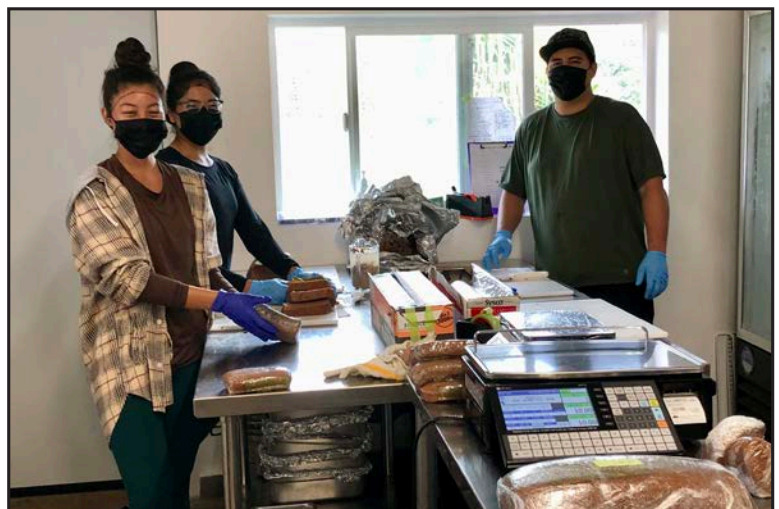
In 2022, Kāko'o 'Ōiwi produced over 20,000 lbs. of fresh food.

Community Outreach, Education and Participation: In 2022, 89 schools visited the He'eia Community Development District with approximately 3,500 participants involved in Kāko'o 'Ōiwi activities. There were also 32 community workdays, and 198 volunteer events with over 6,000 volunteers and 20,000 service hours.