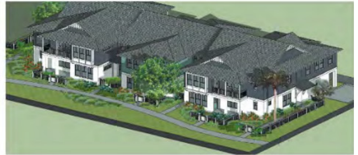
Artist rendering of the proposed flex-loft multi-family attached homes by Gentry, in Kalaeloa.