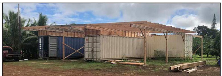
Special projects: The Ho'olauana washpack/rootwash station and the Hale Pepeiao, the mushroom shed construction is underway.