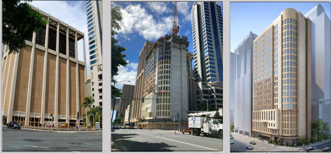
Kokua under construction, September 2022