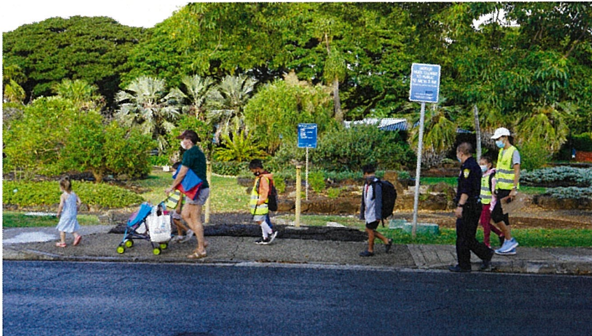
Figure 6 Walking School Bus

The SRTS program anticipates more events will be possible during the coming fiscal year. The program plans to participate in events and Walking School Bus coordination (Figure 6).