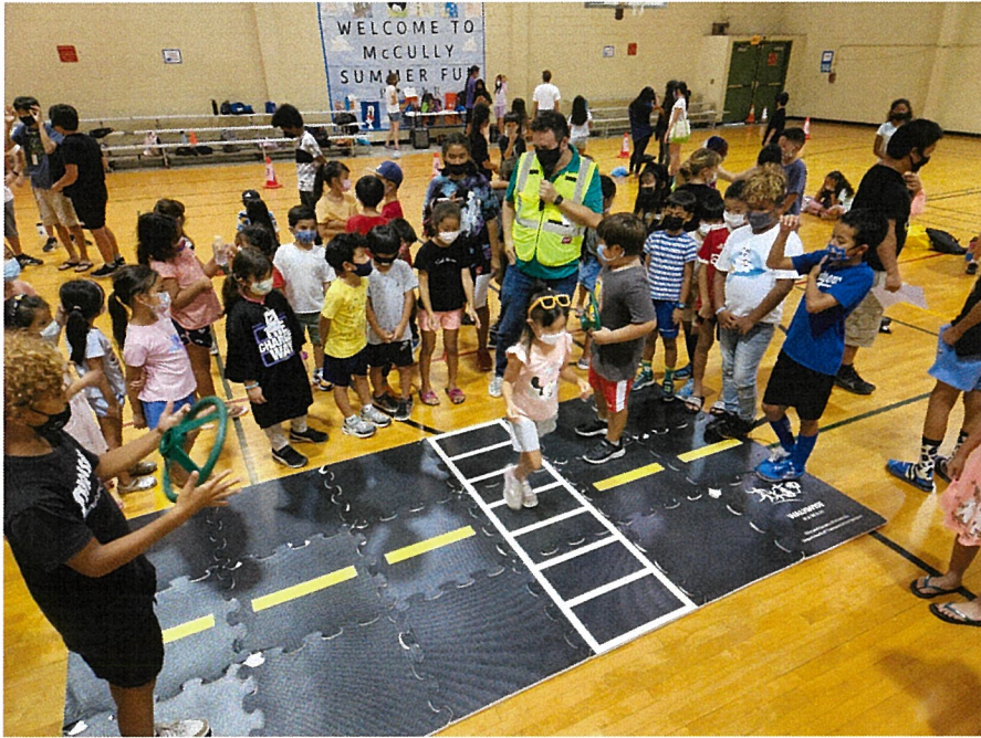
Figure 2 McCully Summer Fun WalkEd crosswalk demonstration