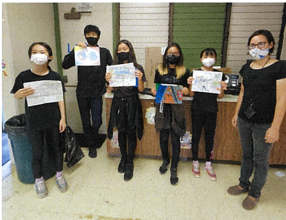
Figure 4 Winners from McCully Summer Fun

A poster contest was administered at all City Summer Fun facilities. The theme of the contest was to draw how we use our five senses while walking and biking. There were 1,394 submissions received. Posters were judged on creativity, use of color, clear messaging, and relevancy. First place (one person - $300 gift card to purchase bicycle), second place (five people - $150 gift card to purchase running shoes), third place (ten people - $50 gift card), and honorable mention (twenty people - certificate) were selected (Figure 4). All The total cost for administrating this contest, including prizes, was $2,473.07. The first place winning poster was showcased on a bus ad within all City buses during the month of August, 2022. All winning posters were also displayed at Honolulu Hale for the month of August.