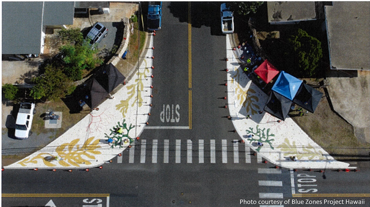
Figure 5 Limu mural and curb extensions created by Blue Zones Project Hawaii on Papipi Road and Hailipo Street in 2020.