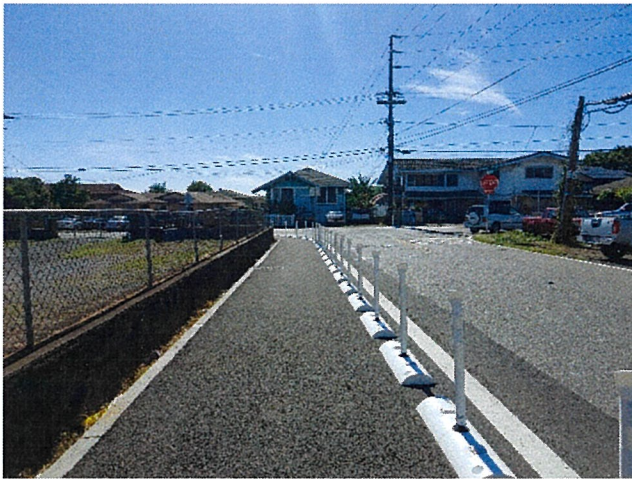
Figure 1 Completed section along Kamehameha IV Road.

The students of Fern Elementary have difficulty walking to school due to drivers illegally parking along the unimproved sidewalk which forces children to walk in the roadway. This project physically discourages illegal parking by paving the unimproved sidewalk area and clearly delineating the pedestrian space using plastic curbs and delineators (Figure 1). The project is anticipated to be completed by January 2023.