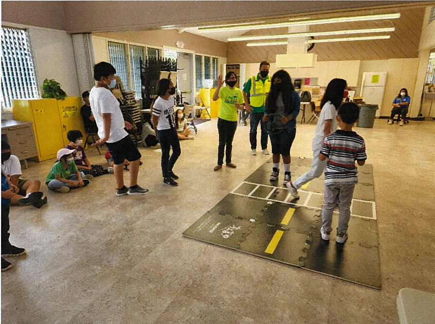
Figure 3 Kauluwela Summer Fun WalkEd crosswalk demonstration