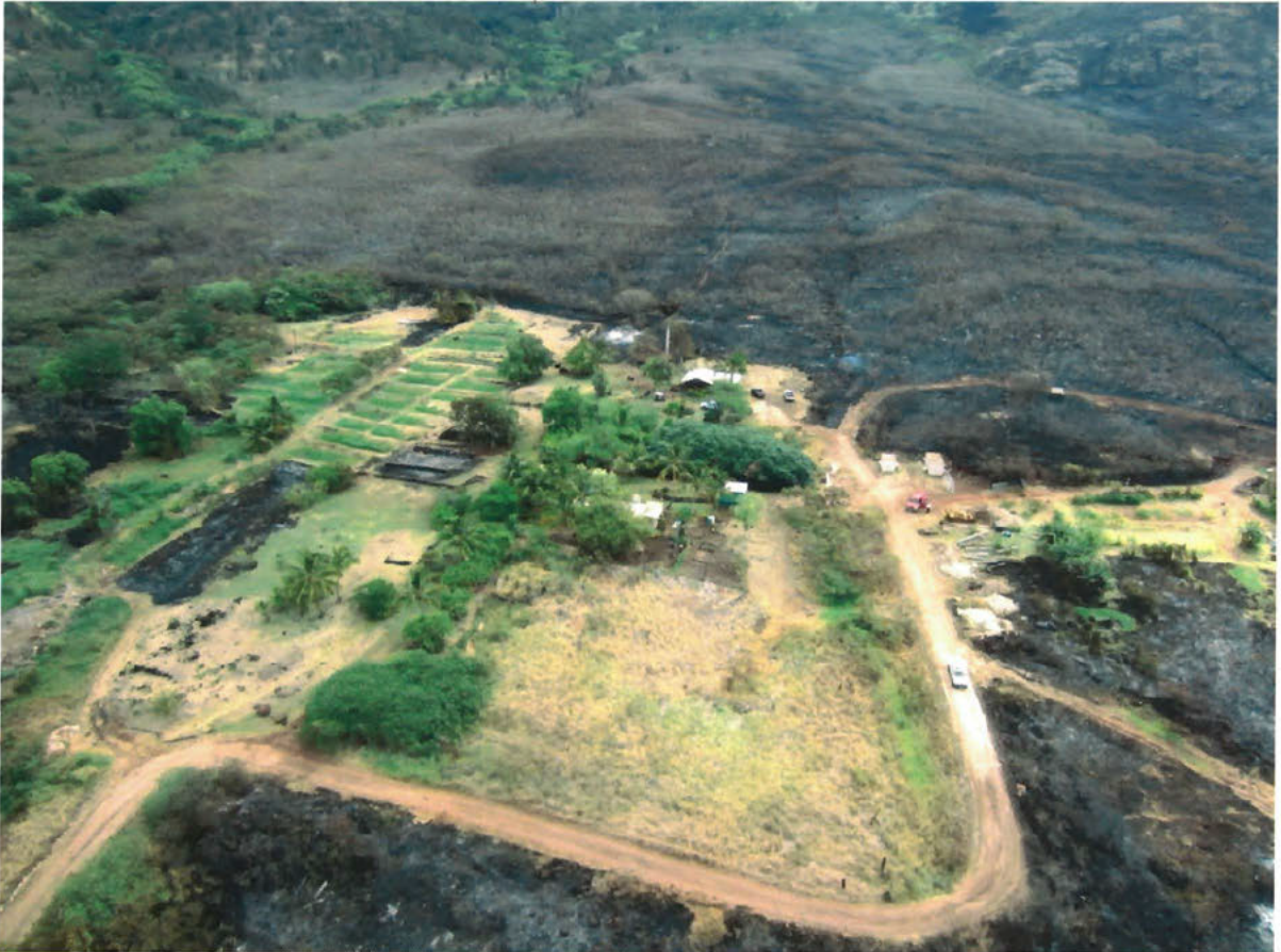
Figure 1. Ka'ala Farm, Inc. 15 years ago after the Lualualei Fire. The land that they work on and have restored withstood the fire. Whereas nearby invasive grasslands erupted into flames.

outbreaks (Figure 1). Over the past 30+ years, KFI has seen what works and what doesn't work when it comes to fire management in Wai'anae Kai. They are prepared and motivated to implement the actions proposed in this project to protect their community and its resources.