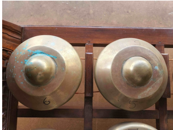
Left: vines grow in behind the plywood installed in front of the corrugated tin walls. Right: bronze gongs tarnish and corrode when protective covers are being laundered due to constant soiling by stray cats.

A charming fact about our property is that it was the first public place in Hilo to be built to accommodate automobiles. But the original designers did not foresee how essential motor vehicles would become. The space is a bit cramped by current standards and definitely not created with accessibility in mind. Before we can engage a contractor to bring the lot up to current standards, we require a design that meets with the approval of our landlord and obtains Disability and Communication Access Board approval.