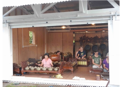
EHCC opened the front of the shed to allow open-air music performances.

The old police chief's garage now houses a full Javanese gamelan (bronze gong orchestra), and EHCC is one of very few places in the United States offering a community (rather than university-based) gamelan program. Classes are free and the gamelan program is thriving, with exotic gongs ringing out across Kalākau Park during rehearsals. Passersby often stop in amazement and come closer to listen; we encourage them to try playing with us, and several have joined the group as a result.