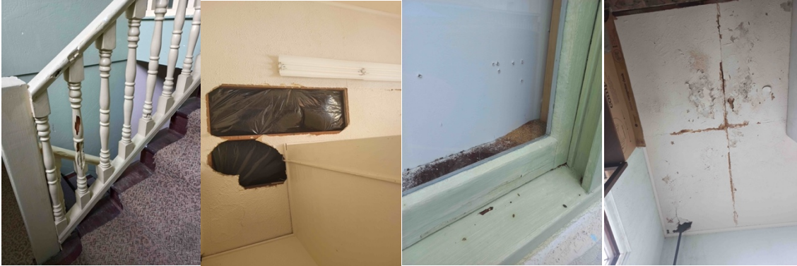
Damage in the main building, from left: termite-damaged banister; holes in ceiling of archive room; termite frass behind the gallery wall; water damage on the ceiling of the dressing room.

The purpose of the Phase 1 improvement project is to begin making EHCC a safer, more inviting venue for the public we serve.