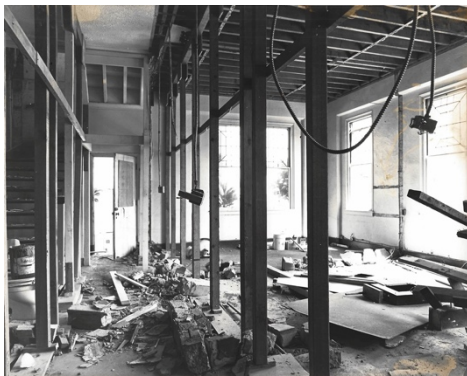
Interior of old police station as it looked when EHCC leased it from the County.

In 1967, a loose coalition of community art and drama groups formed the East Hawaii Cultural Council (now using the trade name East Hawai'i Cultural Center) to share resources. Over time, EHCC became a distinct institution, gaining 501c3 status in 1979 and transforming from an informal group to an established organization in its own right.