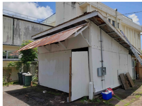
The old police chief's garage, just before EHCC moved its gamelan into the space.

Currently, stink maile ( Paederia foetida ) and other vines creep in behind the plywood interior walls, stray cats frequently urinate throughout the space, and chickens even nest among the instruments, rendering the space odiferous and impossible to keep clean and sanitary. Because the bespoke covers of the instruments must constantly be removed for cleaning due to soiling by cats, the instruments are left exposed to vog and gecko excrement, which are damaging the bronze. The proposed repairs will mitigate these problems and address other concerns such as the acoustical properties of the space (one gong is difficult to hear throughout the room, which is a significant problem because the gong marks the end of each musical cycle and is crucial to helping beginning students orient themselves to the music).