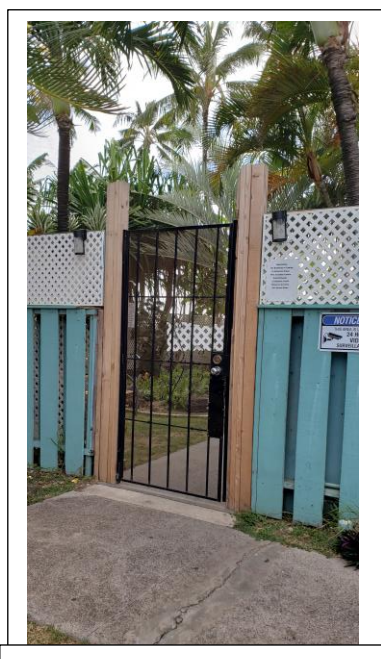
This was a gate repair done (approx) Oct 2020. It still remains the same with no paint to match the fence color.