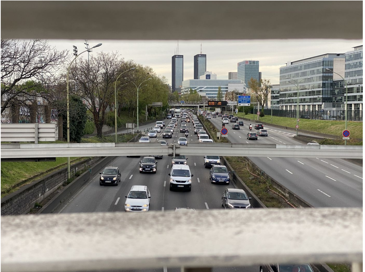
The “périphérique” highway is a prime contributor to the Paris noise map.

Paris is something of a hotspot both for noise pollution and for municipal efforts to control it. European Environment Agency data shows the French capital is one of Europe’s noisiest cities, with more than 5.5 million in the Paris region exposed to road traffic noise at 55 decibels or higher – which the World Health Organization defines as the threshold for cardiovascular disorders and high blood pressure – compared with 2.6 million people in London and 1.7 million people in Rome.