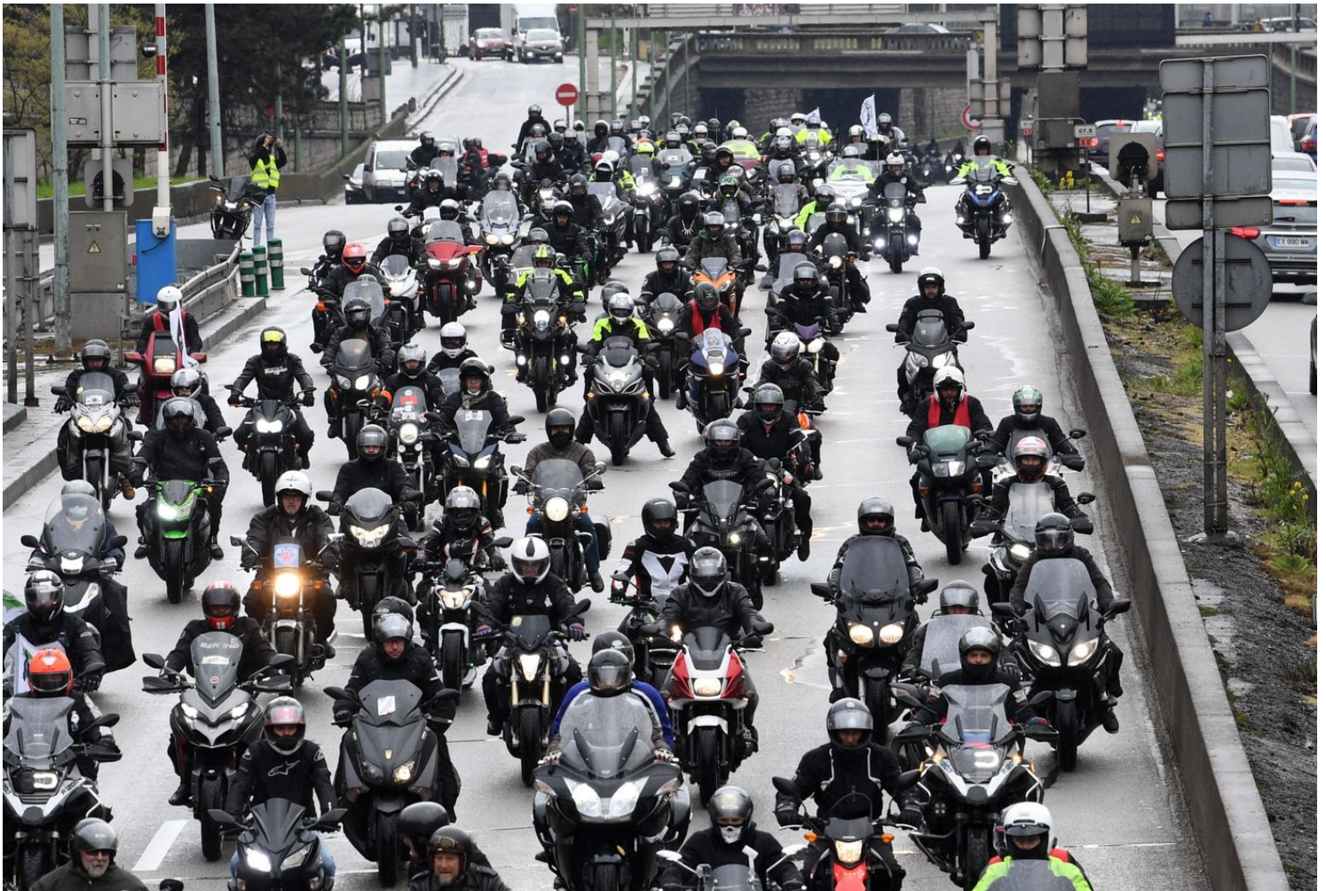
Motorcyclists ride along the périphérique around Paris in April 2021 as they stage a protest against new parking regulations for motorcycles.

But these noise-canceling efforts have also drawn some resistance – especially from motorcycle owners, who staged raucous mass protest rides through Paris in 2021 to protest new parking charges, speed limits and other measures.