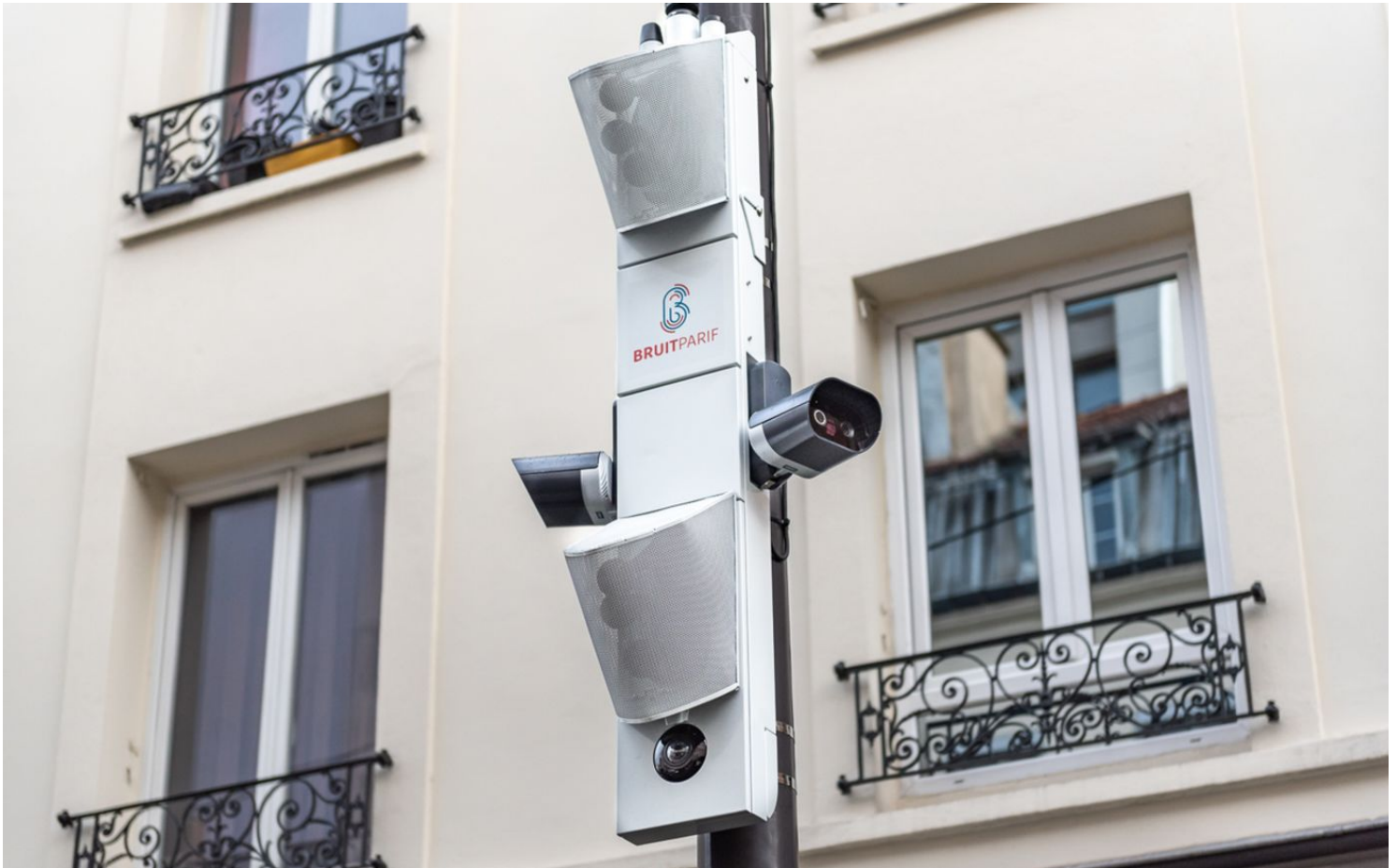
A sound radar device in Paris combines microphones and cameras to detect noise offenders.

The complaints of those living on Rue d'Avron – considered one of the noisiest roads in one of Europe’s loudest cities – haven’t fallen on deaf ears: In February, municipal authorities installed a device known as sound radar – the first ever in Paris – on a lamppost along the thoroughfare in the city’s eastern 20th arrondissement to detect the loudest vehicles. A second was added in the northwestern 17th arrondissement soon after.