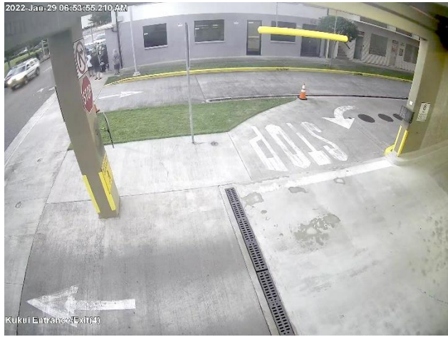
Meth clients waiting for doors to open.