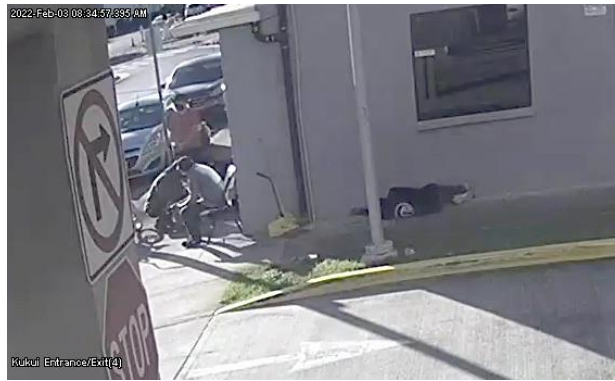
One methadone client sleeping on sidewalk.