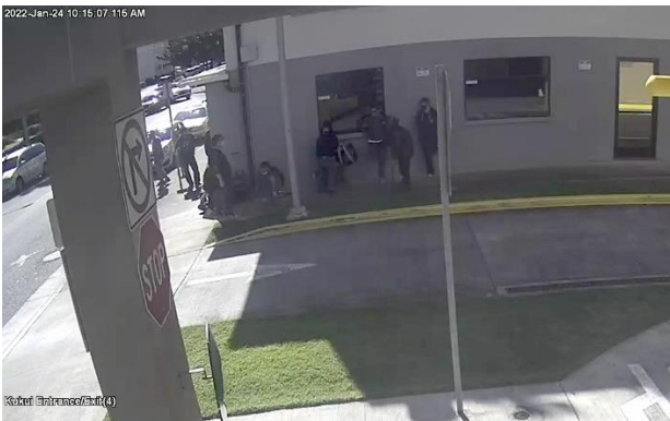
Methadone clients congregating near clinic.