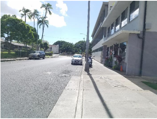
School yard across the street on left. First door on building at right is the methadone clinic.