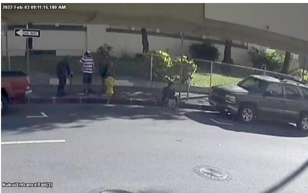
Methadone clinic clients waiting across the Street, right next to school campus fencing.