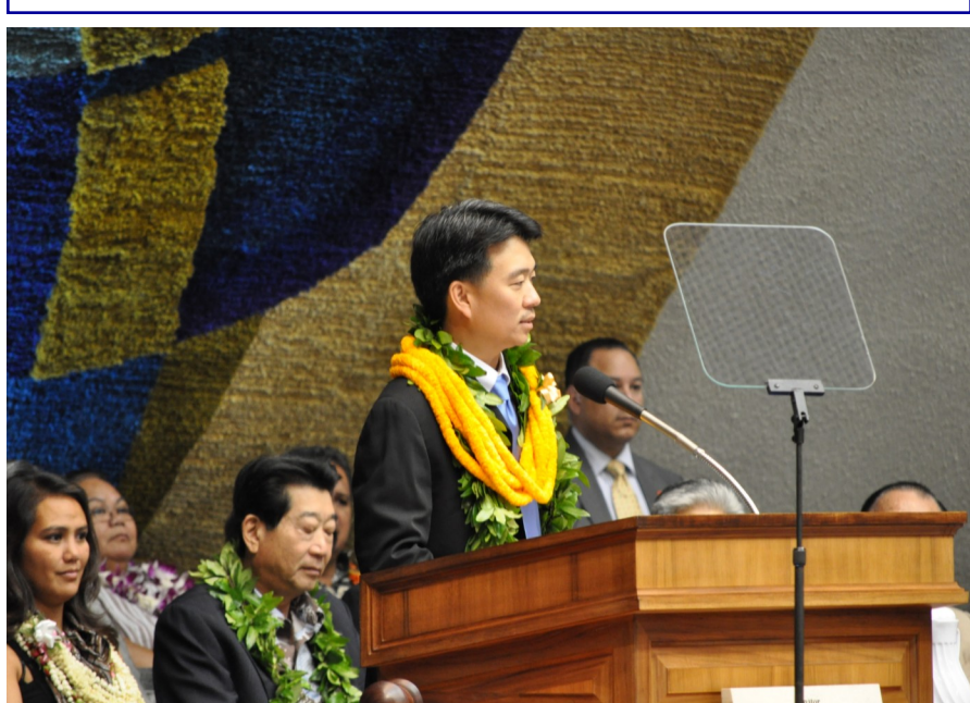
Senate President Tsutsui addressing members, guests and the public