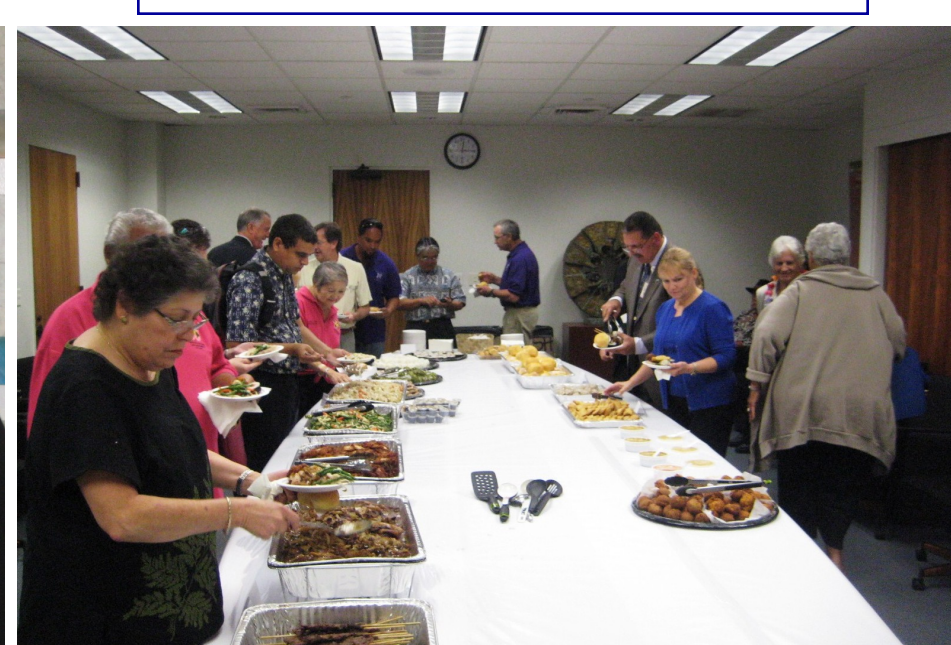
Family and friends enjoying refreshments in the Senate President's Office