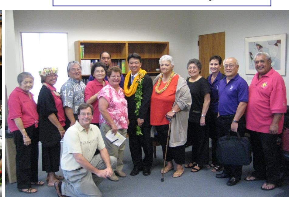
MEO members stopping by to congratulate the Senate President