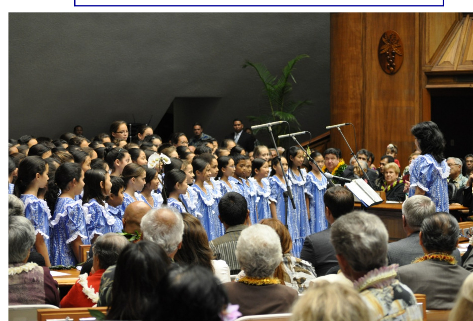
The Kamehameha School Choir entertaining the audience