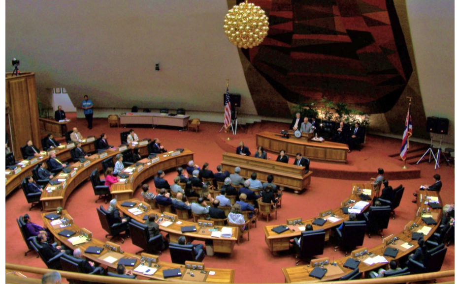
The joint session convened in the House Chambers on April 25, 2011