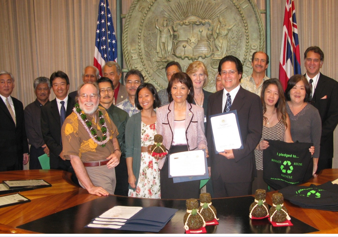
Senate President Tsutsui joined several other Senators and staff members at the Green Government Challenge Ceremony held in Governor Abercrombie's Office on April 20, 2011

The Paperless Initiative has significantly reduced the Senate's paper usage by 80 percent since the program was put in place. During the 2010 session, only 1.5 million pages were printed, compared to 8.3 million pages in 2007. Over the last three years, the Senate has saved half a million dollars in purchasing paper and copy machine expenses.