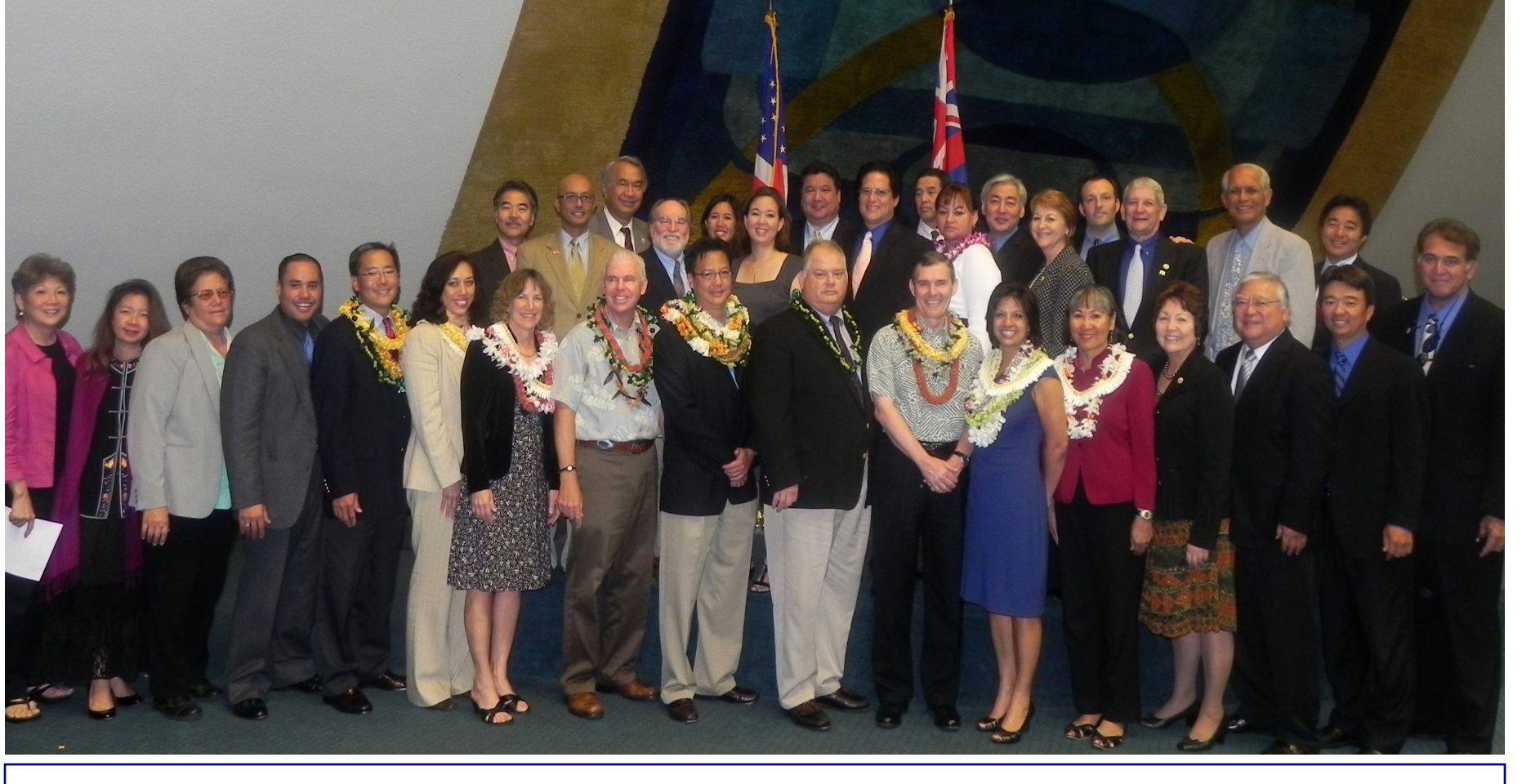
Members of the Senate with the newly appointed Board of Education Members on April 14, 2011

Voters in the 2010 General Election approved a constitutional amendment calling for an appointed, rather than elected, Board of Education.