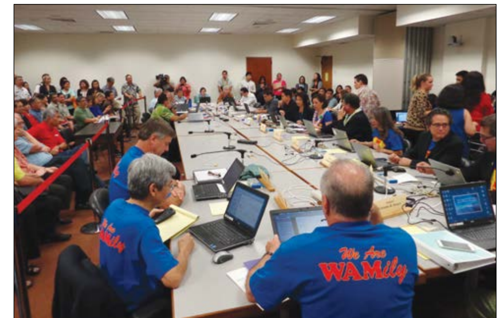
Members of the Senate Ways and Means and House Finance committees meeting during conference to negotiate the State Budget.

SB 1030, Smoking Prohibition For Under 21. Increases the minimum age required to purchase any tobacco product