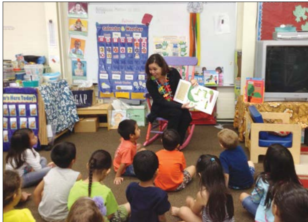
Senator Tokuda reading to Kaneohe Elementary Pre-K students in HCAP's Read to Me program.