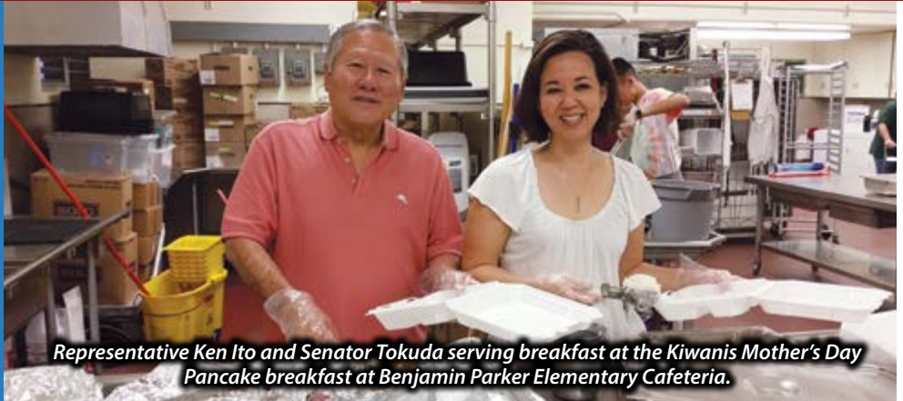
Representative Ken Ito and Senator Tokuda serving breakfast at the Kiwanis Mother's Day Pancake breakfast at Benjamin Parker Elementary Cafeteria.