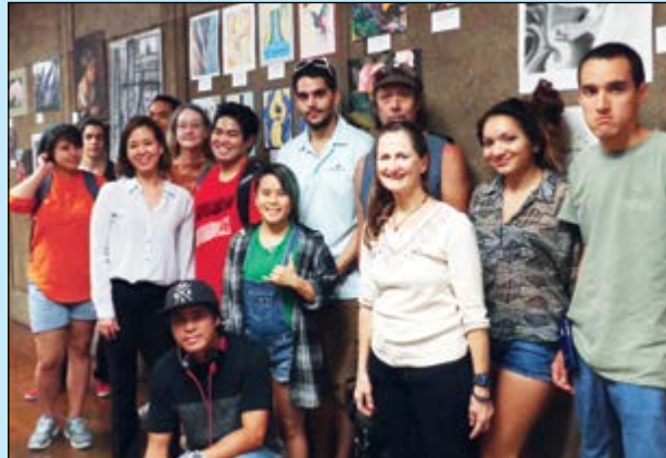
Senator Tokuda with Windward Community College art students who participated in Senator Tokuda's Art Review (STAR) Program.