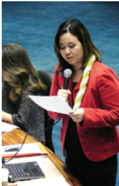
Senator Tokuda giving a speech on the Senate Floor in support of one of the hundreds of bills that passed out of the Legislature in the final days of session.

The Legislature also supports the Governor's broadband initiative to improve services and to ensure that each and every citizen has access. The initiative is supported by Senate Bill 2236 , which assists Clearcom or a partnership headed by Clearcom, Inc., with the planning, designing, constructing, and operating of broadband infrastructure throughout the State.