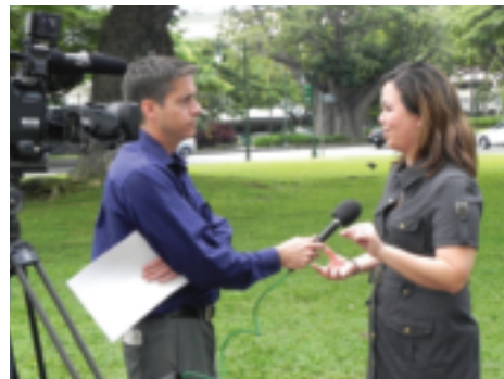
Senator Tokuda being interviewed after presenting to the Charter School Review Panel on the recommendations of the Charter School governance Task Force.