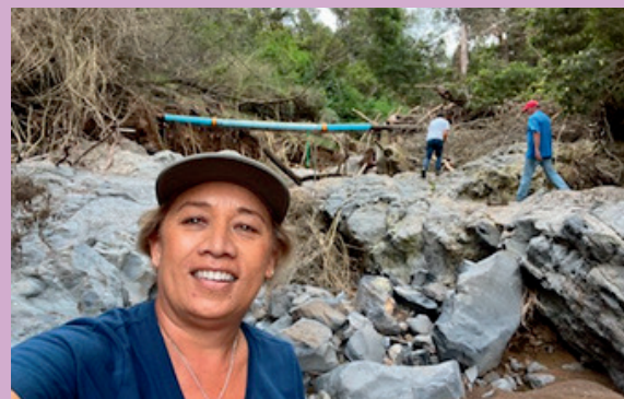
Senator DeCoite conducting a site visit to the UpCounty Water System in February 2022.

Construction to develop public housing facilities.....$650,000