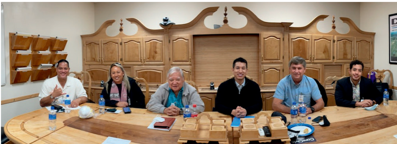
Senator DeCoite on the Public Safety, Intergovernmental, and Military Affairs Committee site visit to Saguaro Prison in Arizona.