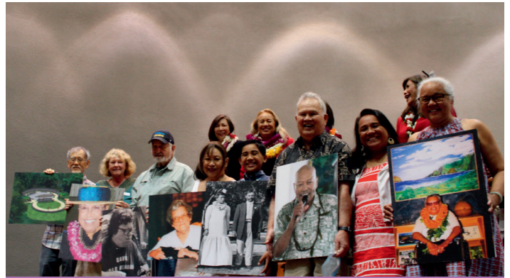
Members of Ka 'Ohana O Kalaupapa in the Senate Chamber after the passage of SB 3338.

Requires the department of health to implement a telehealth pilot project and publish an evaluation report on the telehealth pilot project outcomes. Requires the department to implement and administer a rural health care pilot project to provide physicians and nurse practitioners serving selected rural areas with an availability fee and reimbursements for certain expenses and submit to the legislature an evaluation report on the rural health care pilot project outcomes. Appropriates funds to support the pilot projects.