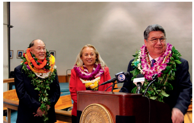
Senator DeCoite participating in the Senate Leadership Press Conference on Sine Die. (Last day of the Legislative Session)