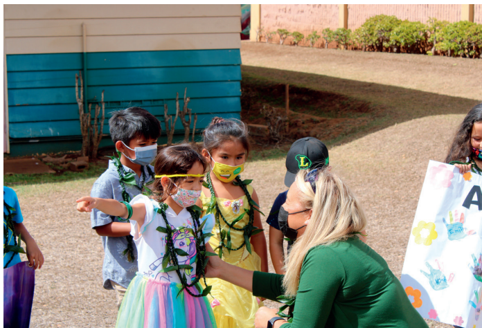
Senator DeCoite with Lānaʻi Elementary Hawaiian Immersion students.

(List courtesy of the Legislative Hawaiian Caucus)