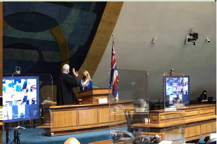
The Maui Senate Delegation