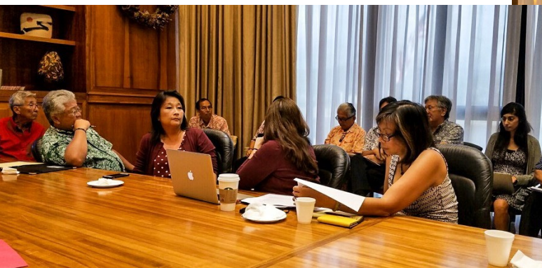
At the Governor's chamber where I learned about grant disbursement policy to ensure that the money we allocated for in the legislative process actually gets disbursed.